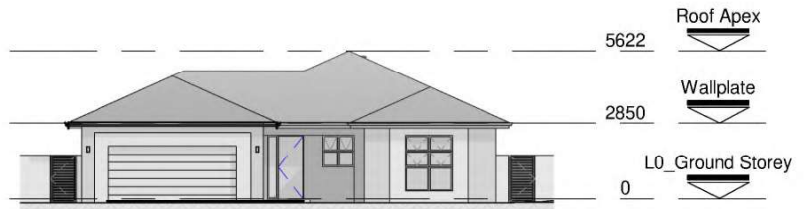
FRONT ELEVATION 1 : 200