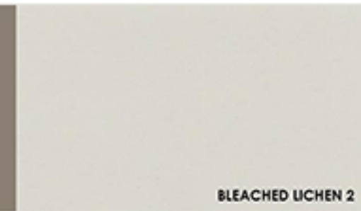
BLEACHED LICHEN 2