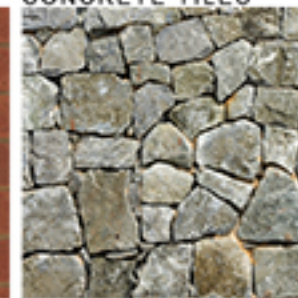
DOLORITE FIELDSTONE CLADDING