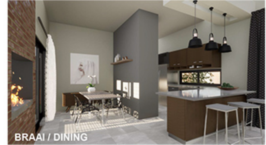
BRAAI / DINING