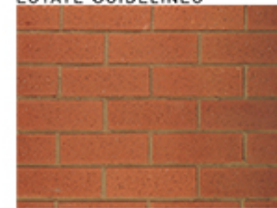
COROBRIK FIRELIGHT TRAVERTINE FBX