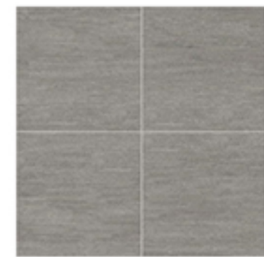
NATURAL COLOUR SCHEME CERAMIC TILES