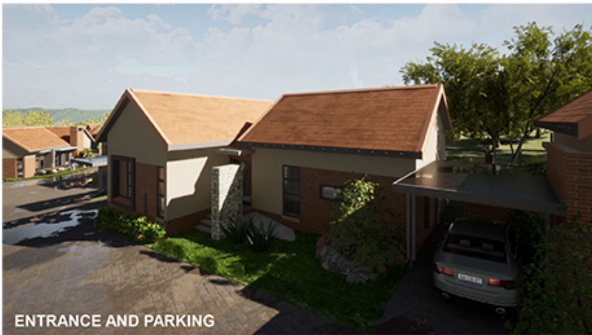
ENTRANCE AND PARKING