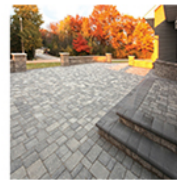
200 x 200mm TUSCAN COBBLE ACCORDING TO ESTATE GUIDELINES