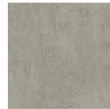
OFF SHUTTER CONCRETE FINISHES