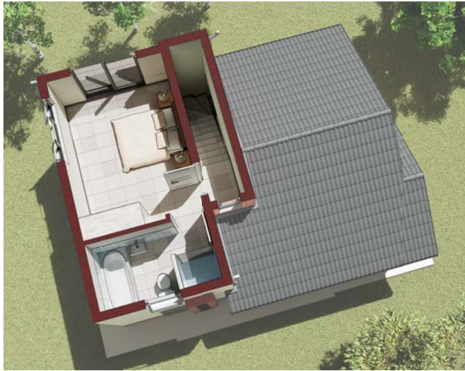
FIRST FLOOR ROOM LAYOUT