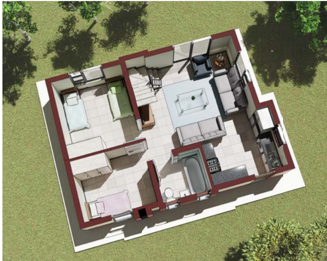
GROUND FLOOR ROOM LAYOUT