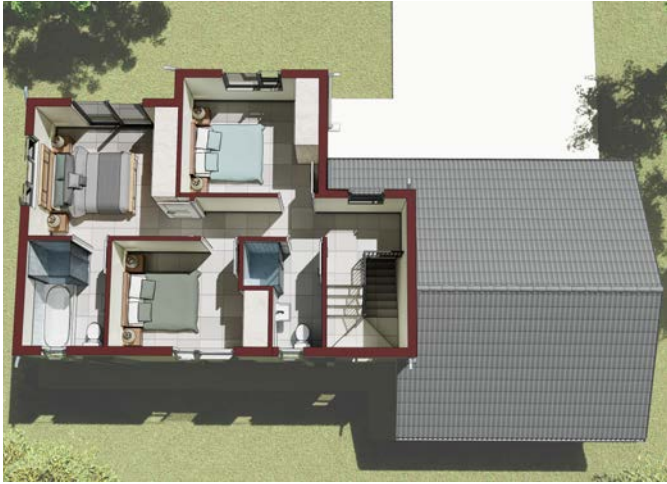
FIRST FLOOR ROOM LAYOUT