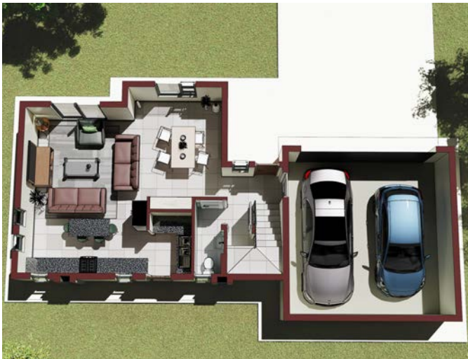
GROUND FLOOR ROOM LAYOUT