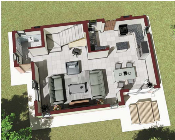
GROUND FLOOR ROOM LAYOUT