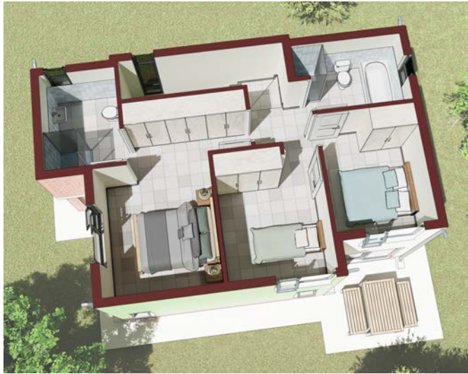
FIRST FLOOR ROOM LAYOUT