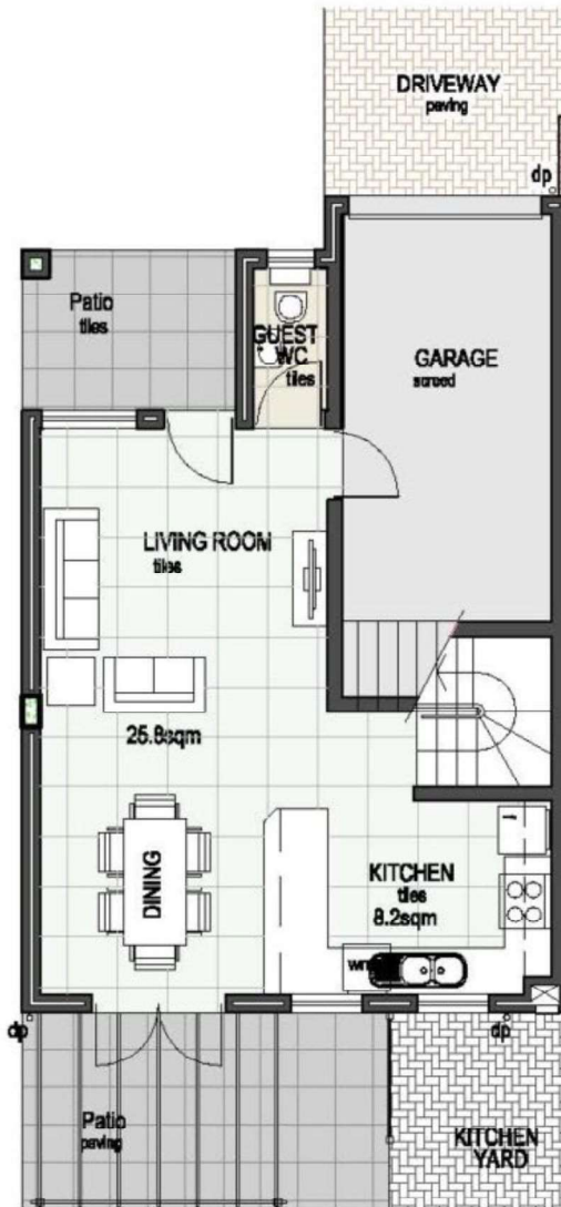
GROUND FLOOR PLAN scale 1:100