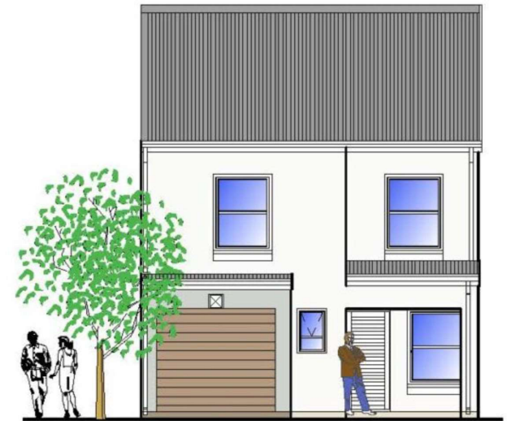
TYPICAL STREET ELEVATION scale 1:100