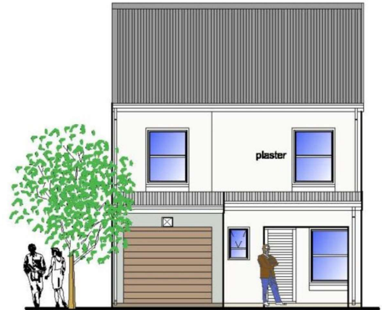
TYPICAL STREET ELEVATION scale 1:100