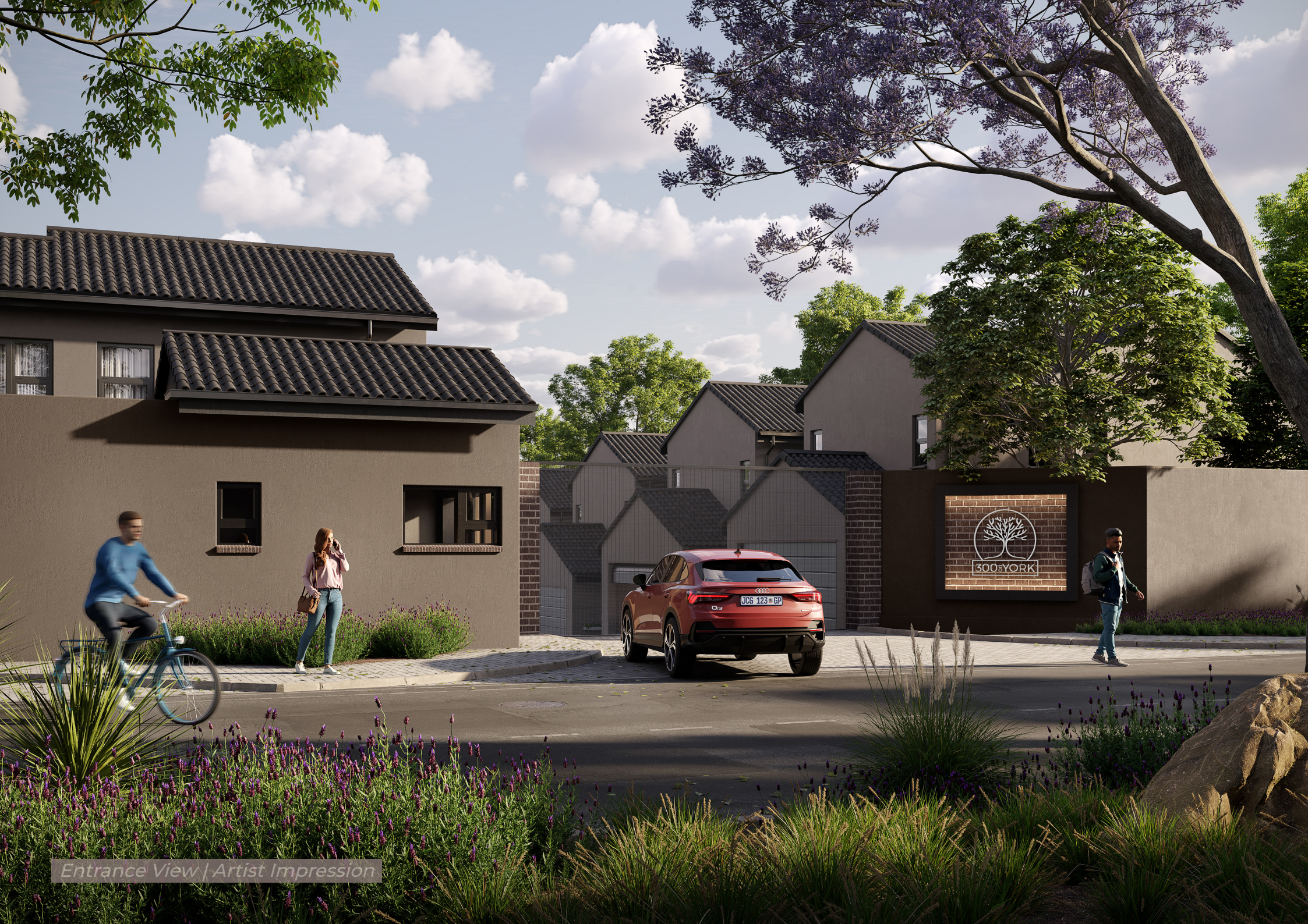
Entrance View | Artist Impression