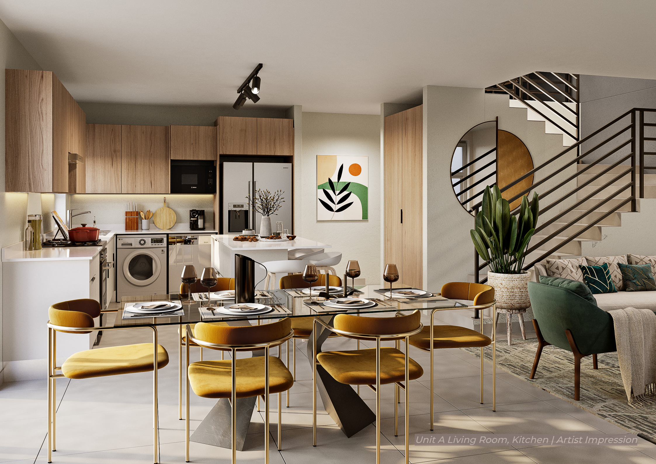
Unit A Living Room, Kitchen | Artist Impression