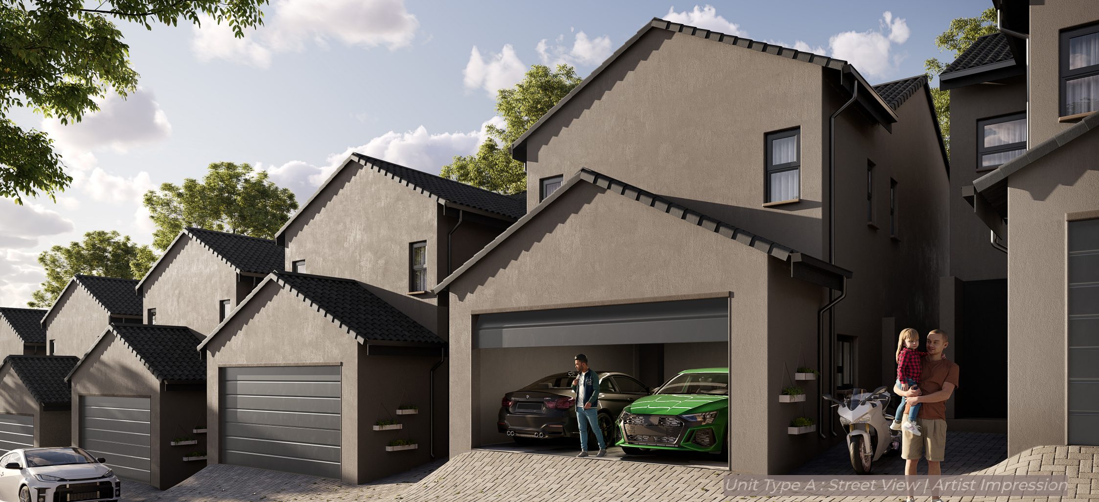
Unit Type A : Street View | Artist Impression

Introducing 300 on York, a new standard in suburban living. With 18 exclusive beautifully designed homes, each featuring 3-bedroom homes with all ensuite bathrooms providing privacy and comfort for every member of your family. The living area with open plan