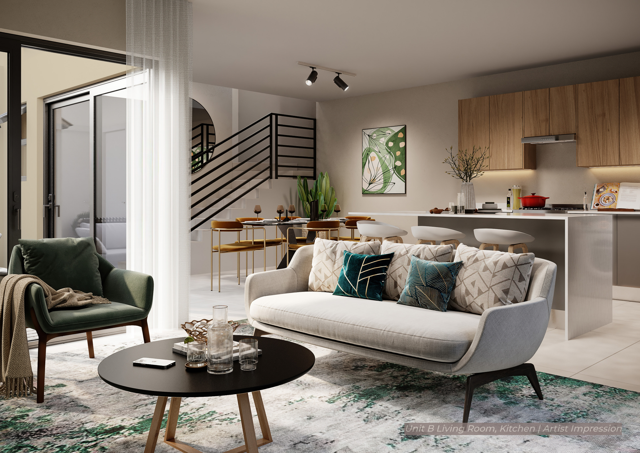
Unit B Living Room, Kitchen | Artist Impression