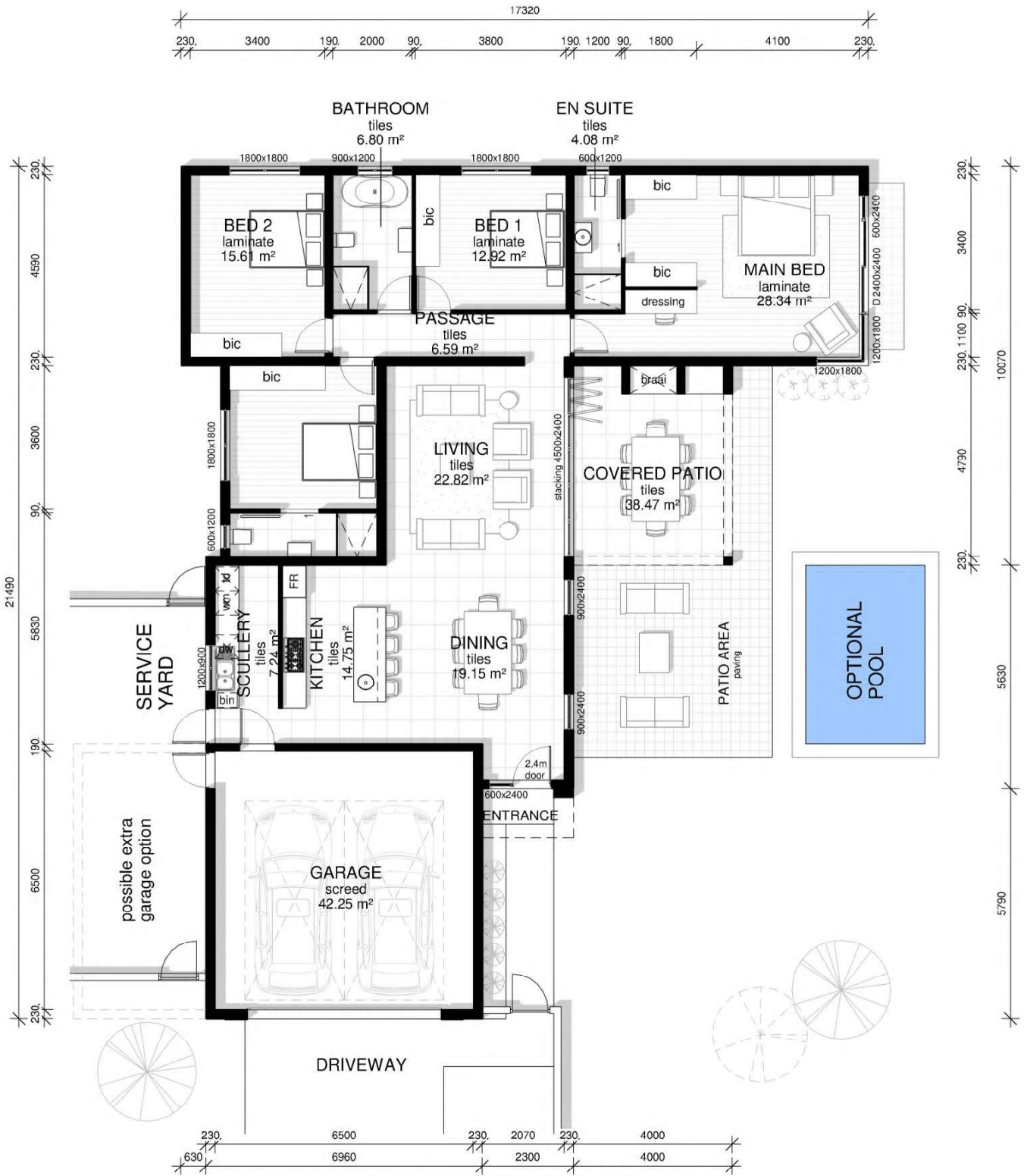
GROUND STOREY PLAN 1 : 100