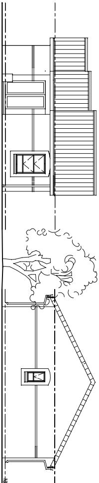
ENTRANCE ELEVATION SCALE 1:200