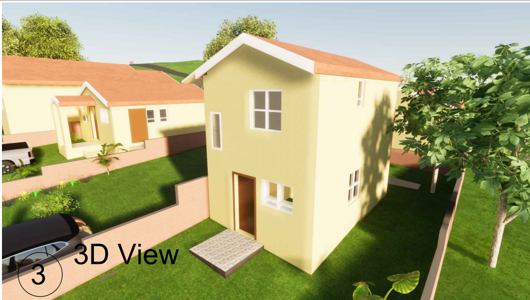
3 3D View