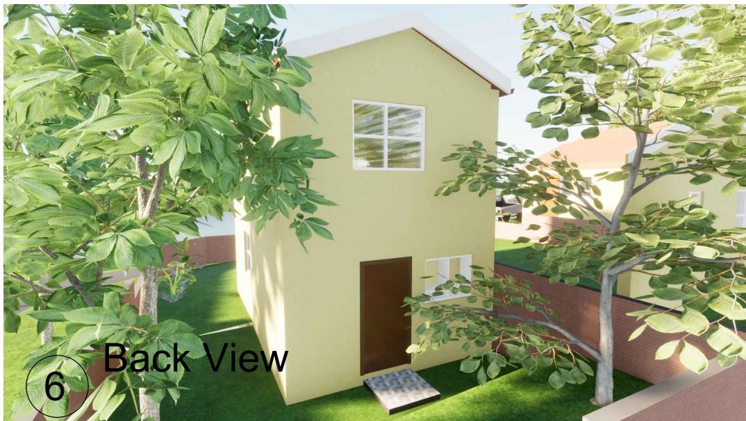
6 Back View