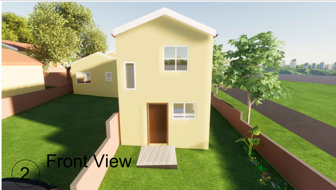
2 Front View