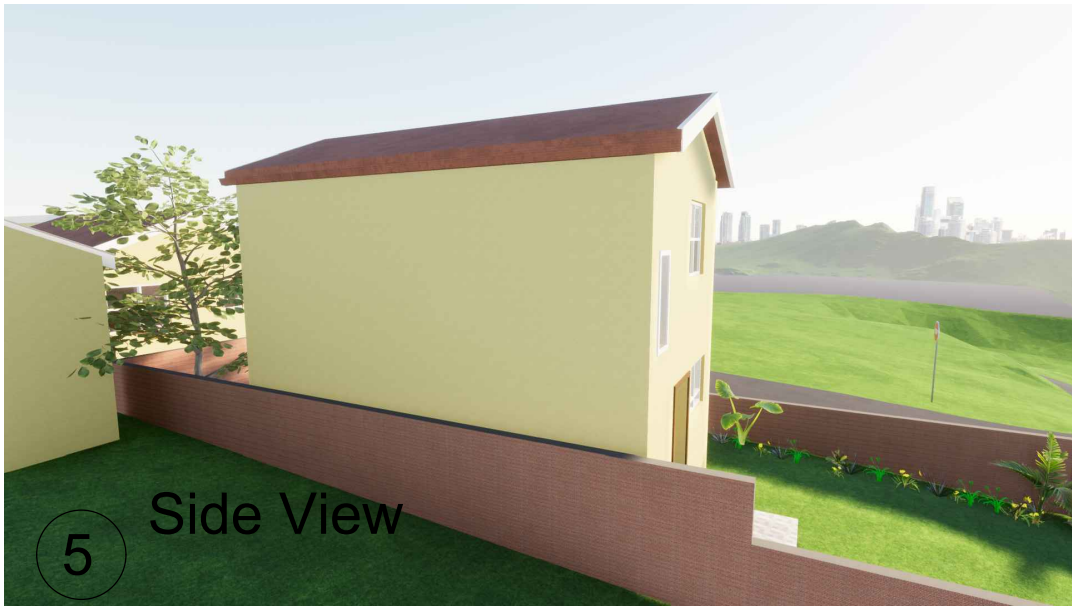
5 Side View