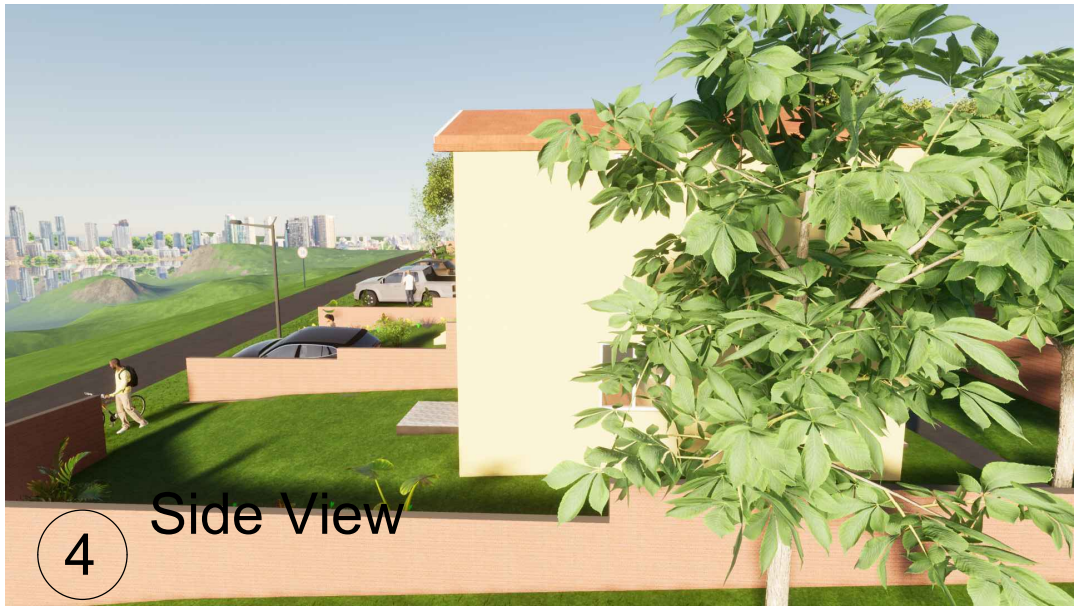
4 Side View