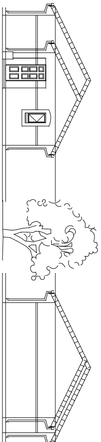
ENTRANCE ELEVATION SCALE 1:200